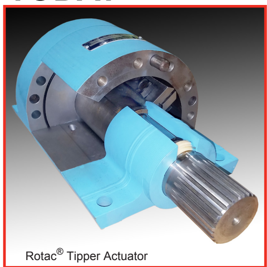
Rotac ® Tipper Actuator

Micromatic makes the only cart tipper using our Rotac ® rotary vane actuator One moving part means increased durability and easy service